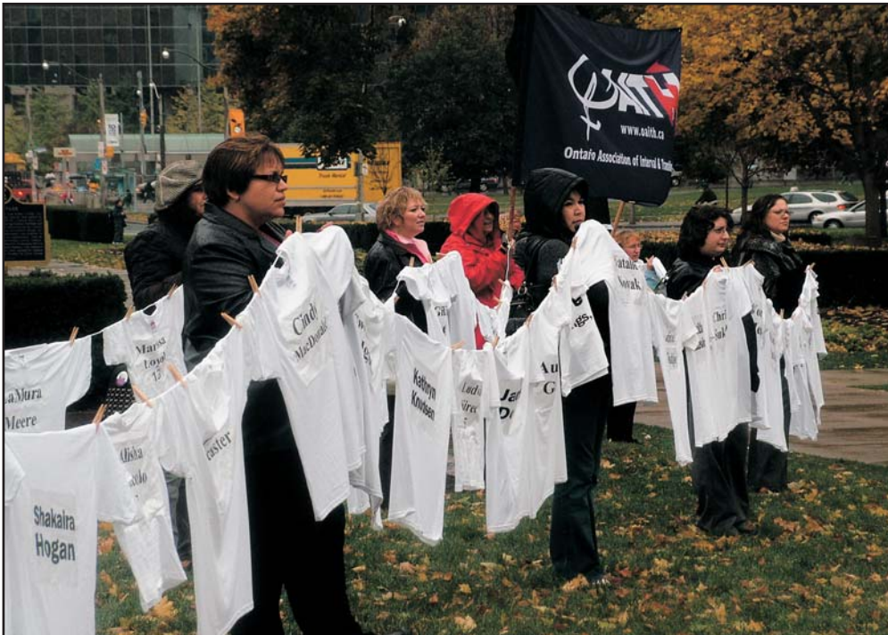
Remembering with Action: OAITH shelter representatives from across Ontario hold a t-shirt "clothesline" naming women and children murdered since 1995 in situations where intimate partners were charged or committed suicide. There are, sadly, over 300 t-shirts so far.

We'll be back to report the results of our countdown on government action to end violence against women. But next year, we're moving inside. ■