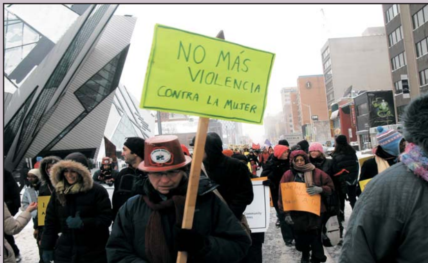
Out in the cold: Women at the snowy International Women’s Day March. More often now there is scant time and fewer resources available to organize political action with other women except for ‘marker’ days like IWD and December 6 th .

As public funding becomes more out of line with true costs of service delivery, women’s shelters are now forced to spend more time competing for private funding and donations; even to competing with each other. In some communities, this is “doable,” as they say, in others, quite frankly impossible.