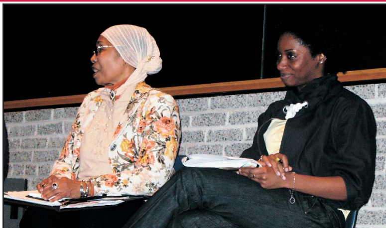
Talking to the Experts: On International Women’s Day, women from the Voices of Women Organizing Project in New York spoke in Toronto about their work, and the need for women’s shelters and all community systems to involve current survivors in changing policy and practice.

Working with a survivor advisory group, OAITH will be collecting input of survivors