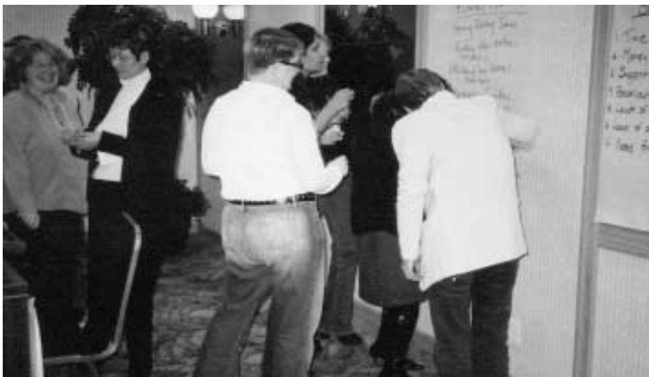
At the November workshop day, OAITH members choose priorities for skills development in coalition building between shelters, with other community advocates and with survivors of violence.

We are hoping during the advocacy project timeframe to find a solution that allows us to build a website that is current and supportive to shelter staff, volunteers and Boards that want to work on systemic advocacy issues.